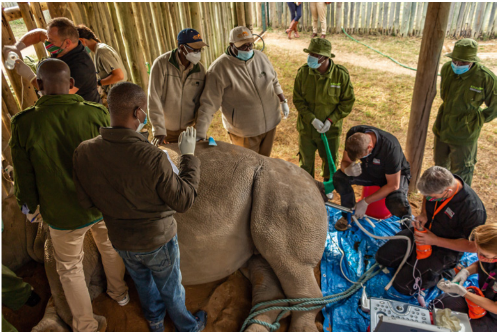
FIGURE 1 The international team performing an oocyte collection on Najin, one of the last northern white rhinoceroses wearing face masks on August 18, 2020 in Ol Pejeta, Kenya

After the Kenyan borders reopened on August 1st, 2020, an oocyte collection in Kenya was performed as soon as mid-August. Many obstacles had to be overcome. With support of Czech authorities, both Germany (July 31, 2020) and the Czech Republic (August 5, 2020) were included in the list of countries considered safe for entry to Kenya. A health certificate with a negative test result for Covid-19 not older than 48 hours was requested upon entry to Kenya (later extended to 72 hours). Testing without symptoms or suspected infection was not readily available in Germany. Most laboratories require at least 24 hours for returning a test result. In combination with 12 hours flight time, this posed a challenging task. Reduced flight schedules complicated planning. Nevertheless, the German-Czech team boarded one of the first flights to Nairobi after re-opening of Kenyan borders. The idea to have a meeting of the consortium in Kenya at this occasion was rejected to keep the team as small as possible. The procedure was approved under the condition to fulfill the laws on hygiene and social distancing in Kenya. Therefore, masks had to be worn in public areas during the procedure, despite impaired communication and of vision if wearing glasses (Fig. 1). Sanitizers, a hand washing point, and a person to oversee